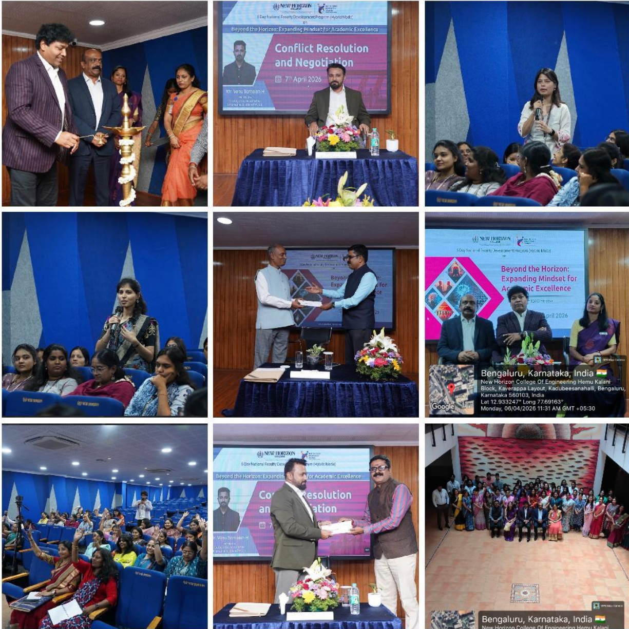
Building an AI-ready mindset to expand horizons and achieve academic excellence