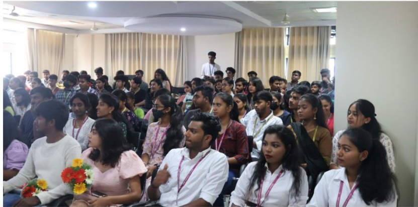
"Team photograph with the Cultural Head, Club head, Speakers and Student Co-ordinators"