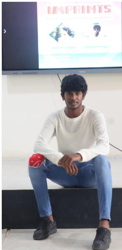
"Ramp Walk of the Speakers"