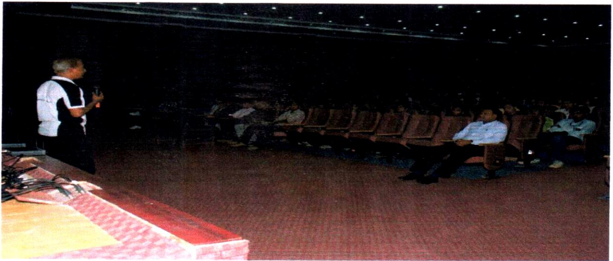
Photos from Pre Placement Training Program