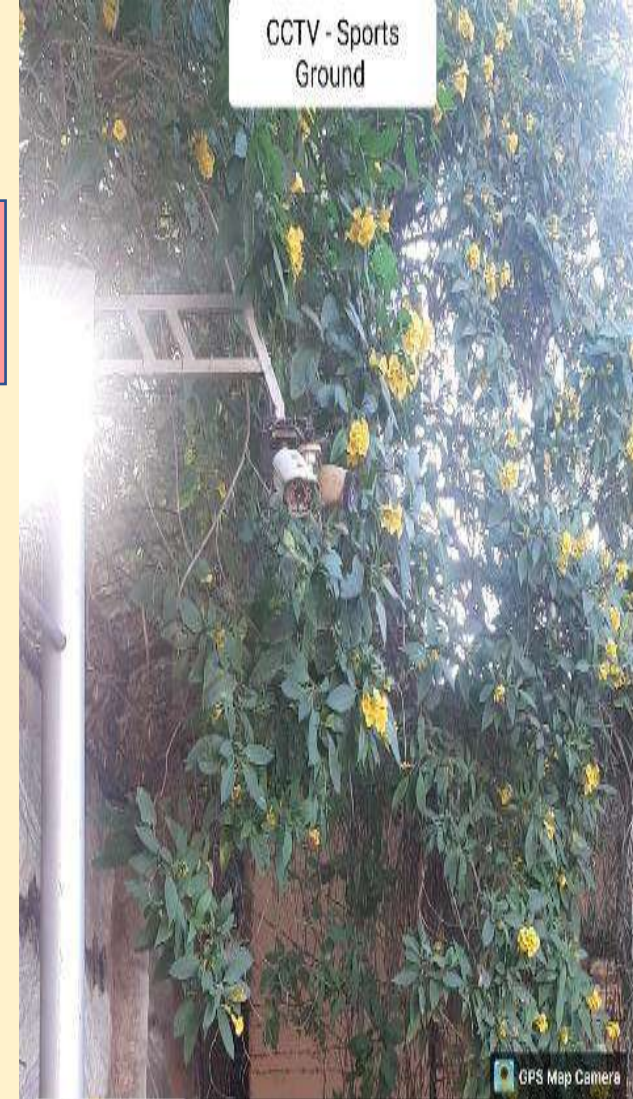
CCTV - Sports Ground