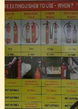
Fire extinguisher Third floor

Shaheed Hemu Kalani Block, Kaverappa Layout, Kadubeesanahalli, Kadubeesanahalli, Bengaluru, Karnataka 560103, India Lat 12.933317° Long 77.691667° 20/01/22 03:06 PM