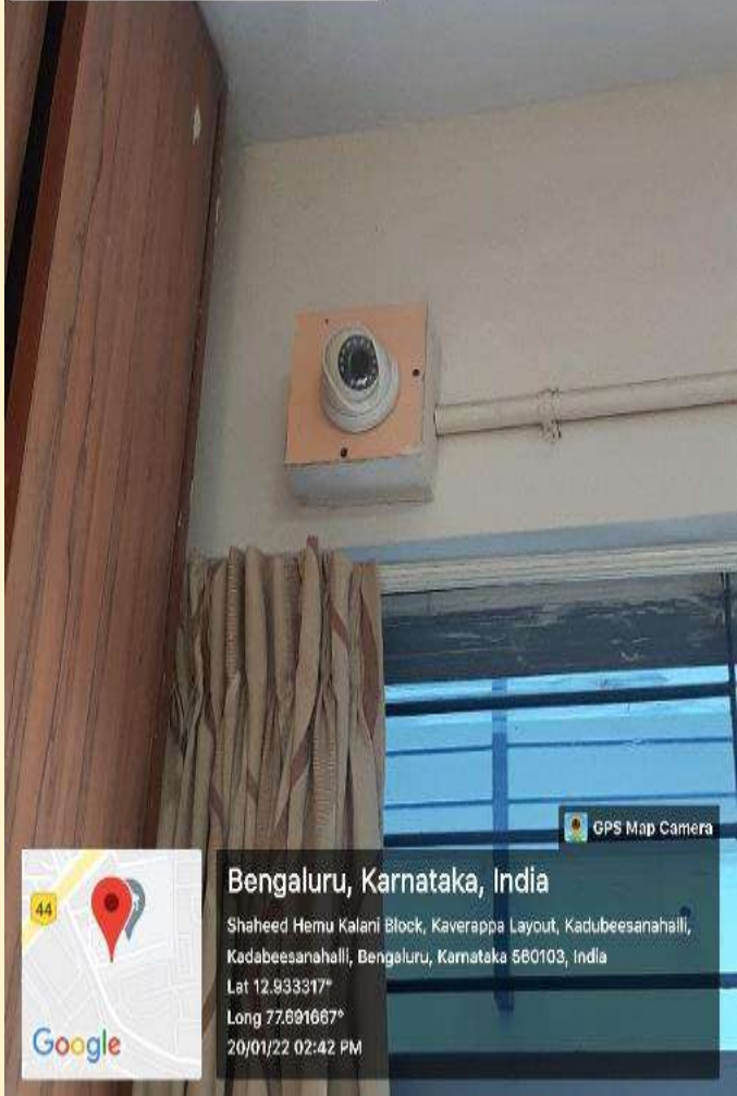
CCTV in Administrative office