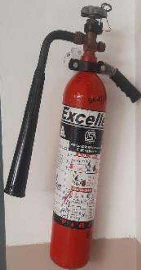
Fire extinguisher ground floor

Shaheed Hemu Kalani Block, Kaverappa Layout, Kadubeesanahalli, Kadubeesanahalli, Bengaluru, Karnataka 560103, India Lat 12.933317° Long 77.691667° 20/01/22 03:11 PM