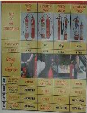
Fire extinguisher First floor