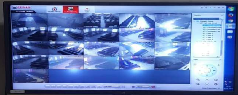
CCTV surveillance in principal office