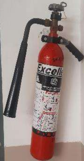
Fire extinguisher second floor

Shaheed Hemu Kalani Block, Kaverappa Layout, Kadubeesanahalli, Kadubeesanahalli, Bengaluru, Karnataka 560103, India Lat 12.933317° Long 77.691667° 20/01/22 03:06 PM